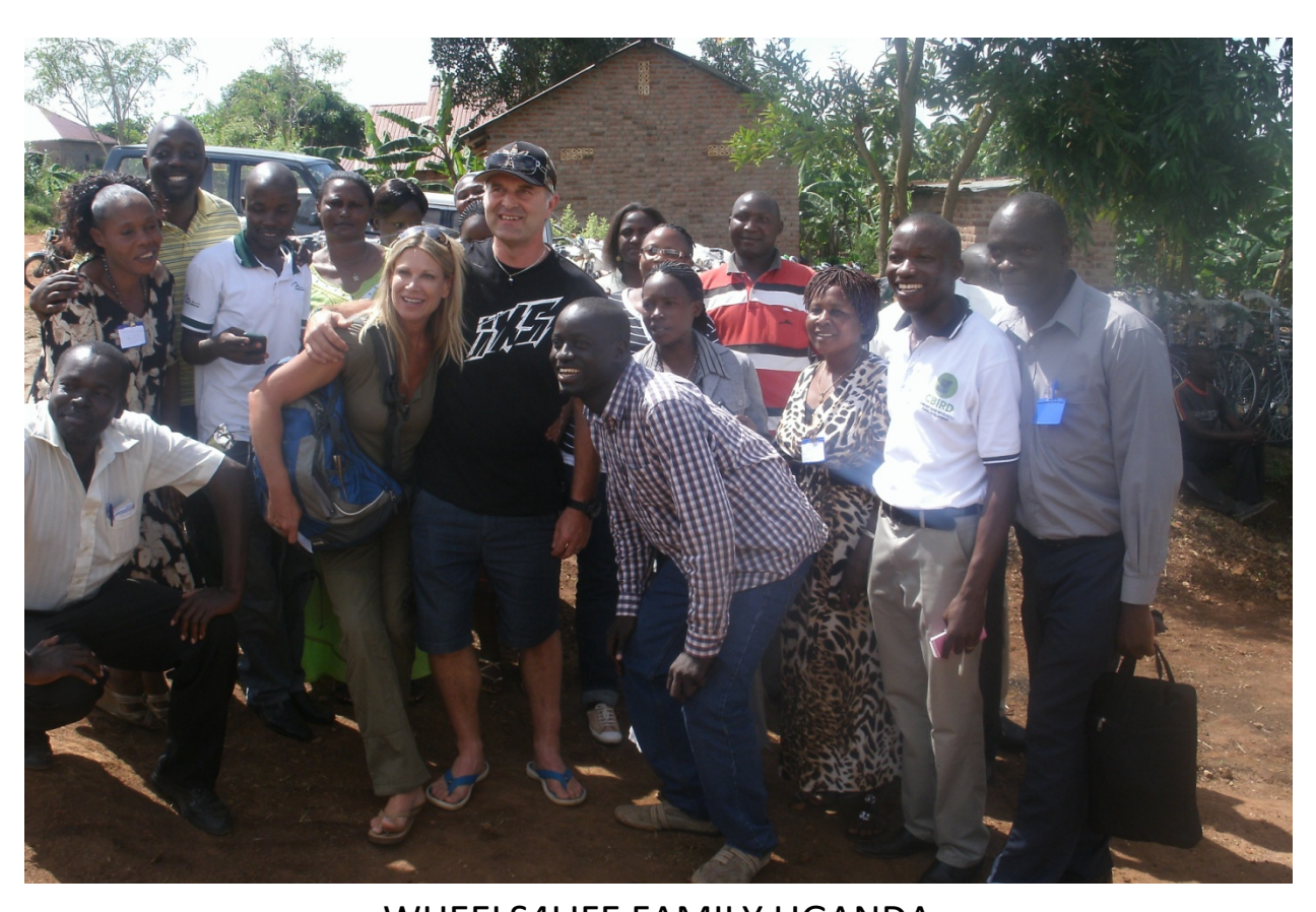
WHEELS4LIFE FAMILY UGANDA A REPORT ABOUT BENEFICIARY GROUPS - OCTOBER 2018